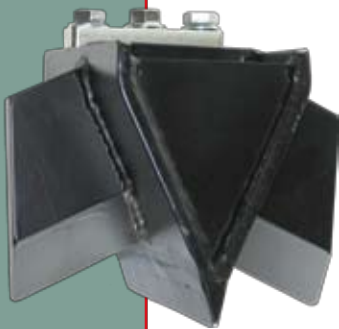
Cross splitter HF – 130