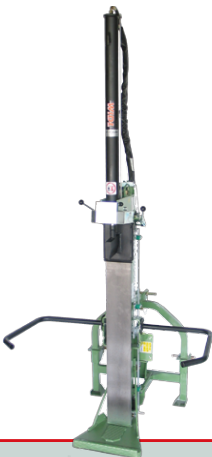
Log splitter HT-130 H