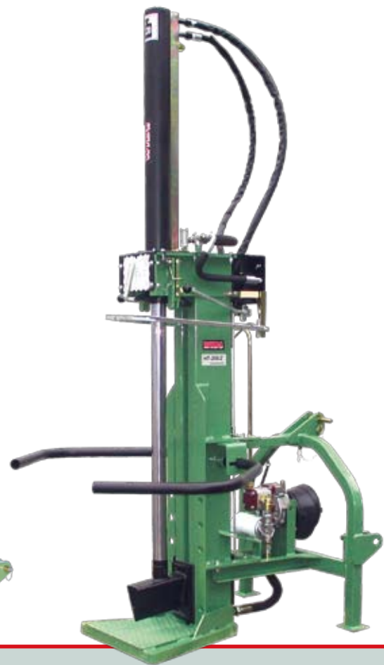
Log splitter HT-200 Z