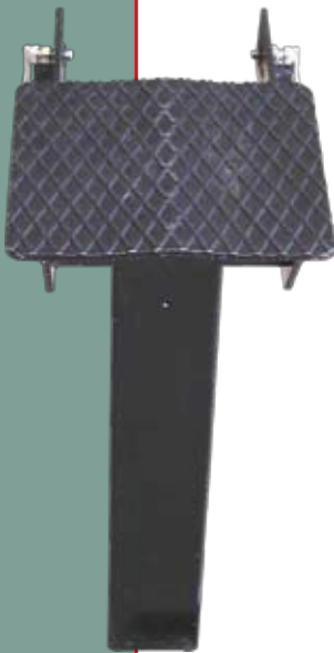
Splitting wedge broadening HT-130