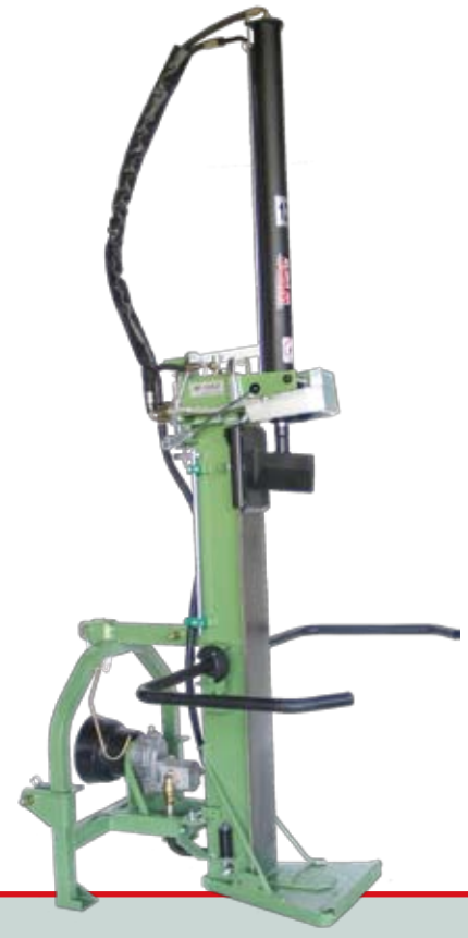
Log splitter HF-125 Z