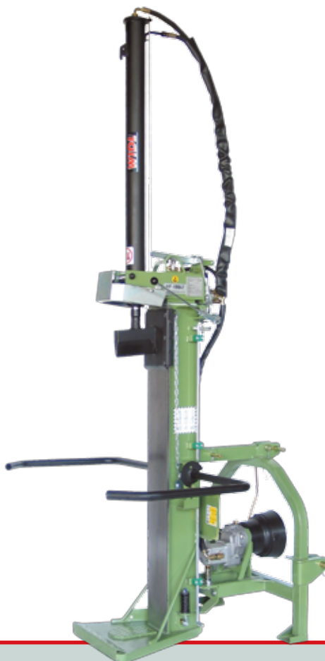
Log splitter HF-180 Z