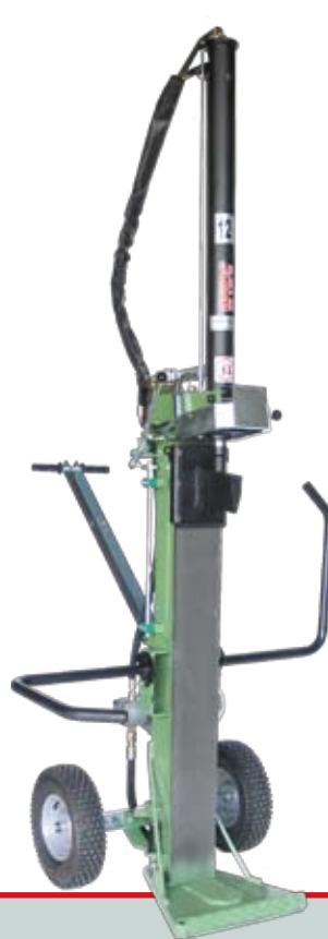
Log splitter HF-125 E