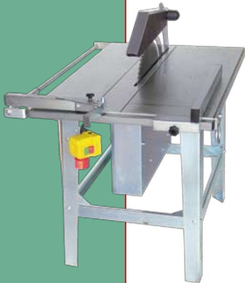
design model BK 450/S - fixed