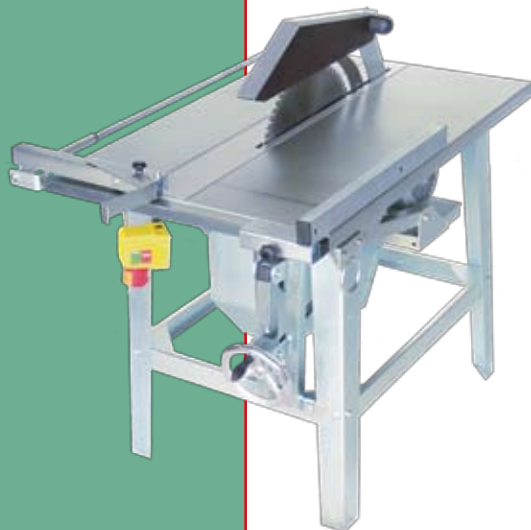
design model BK 450/H - height adjustable